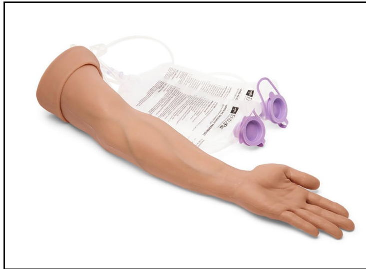
CAE Medicor Peripheral IV Arm

This training model is intended as a platform for the practice of peripheral intravenous access and phlebotomy procedures.