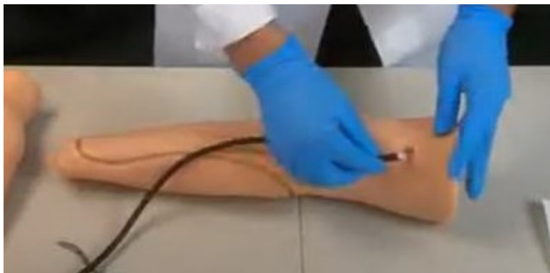
Inserting Tubing Into End Fitting