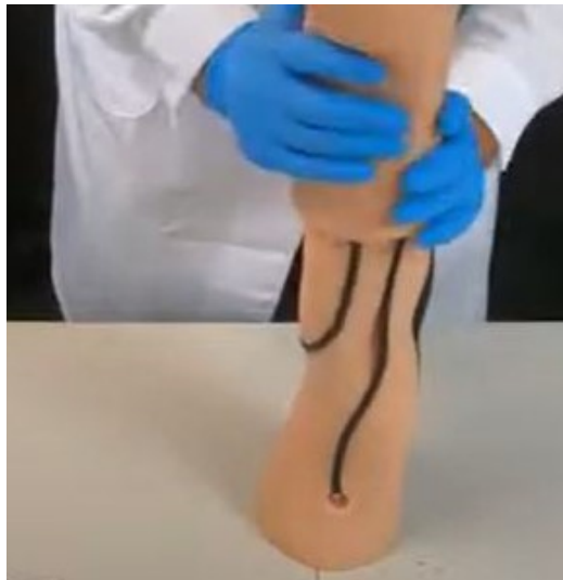
Rolling the Skin Down the Arm Base