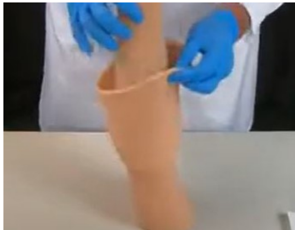
Pulling the Skin Off