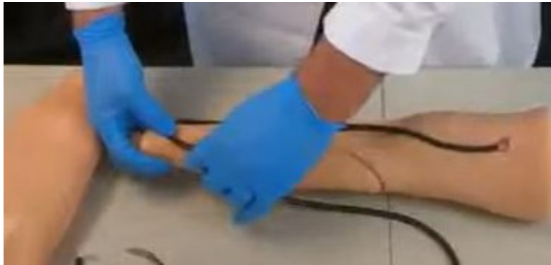
Pushing the Tubing Into Place