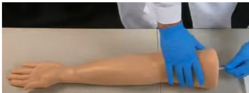
Reconnecting the Connector Tubes