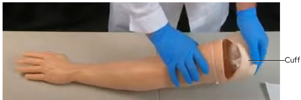
Removing the Cuff