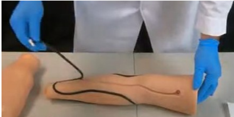
Removing the Tubing