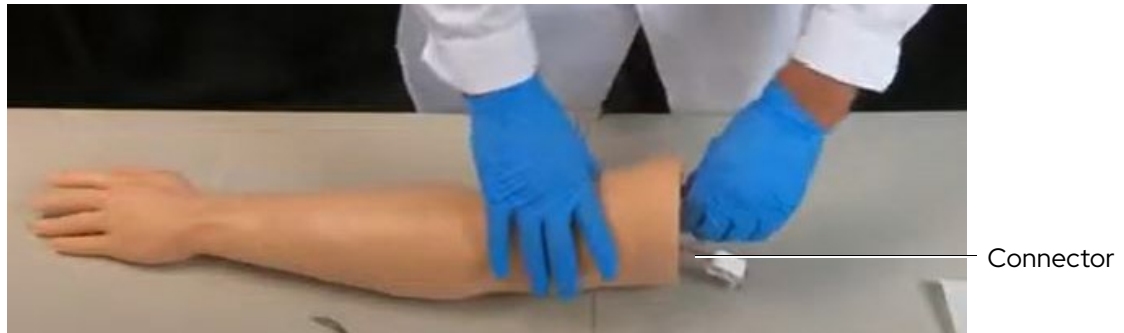
Removing the Connectors