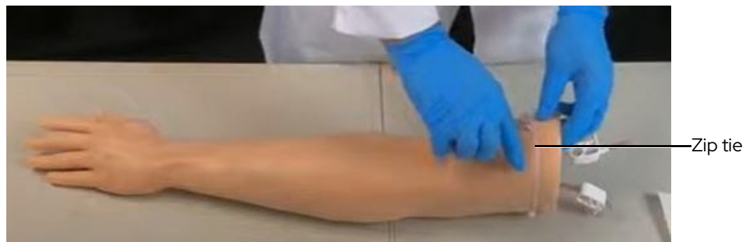
Cutting the Zip Tie