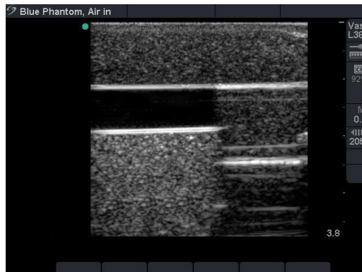
Low Fluid Level - Poor Imaging

A low fluid environment is identified by the inability to see the vessel during normal ultrasound imaging. This is due to the presence of air, which reflects all sound energy.